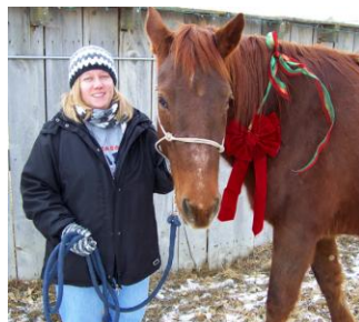
Christmas Photo's from Open Ranch in December