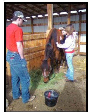
Daisy being groomed at Open Ranch